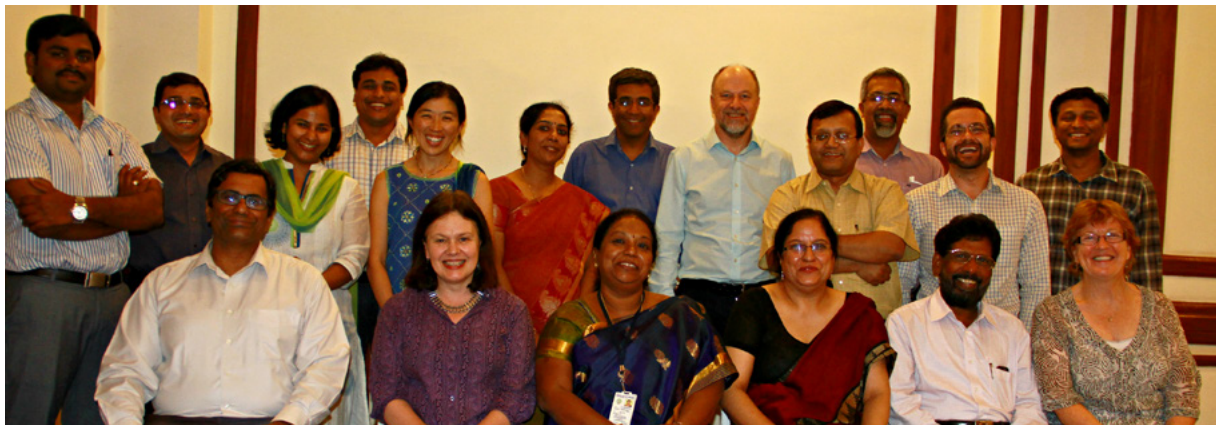
Staff at The George Institute, India's Hyderabad office in 2014.

During those days, it was a small organisation on the rise where everyone knew each other’s names. Today, with more than 700 people