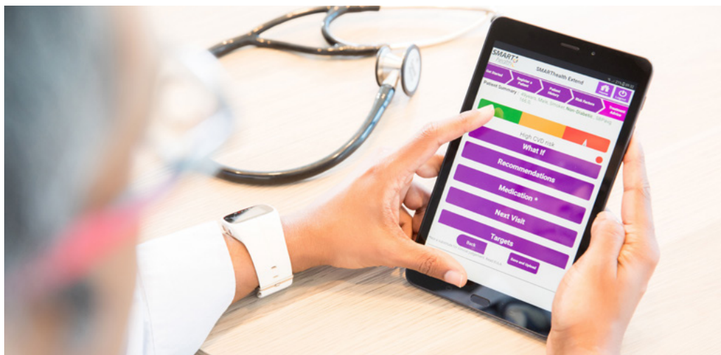
The SMARThealth app, changing the way primary health care is delivered.

to positively impact on the health of thousands of people in Australia, India, Thailand, Myanmar and Indonesia.