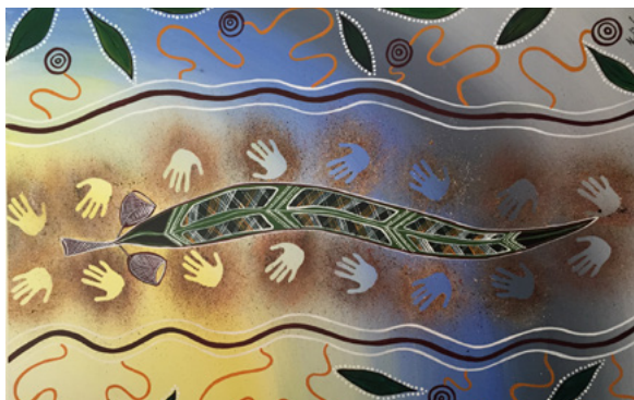
Getting it Right. Validating a screening tool for depression for Aboriginal and Torres Strait Islander peoples.