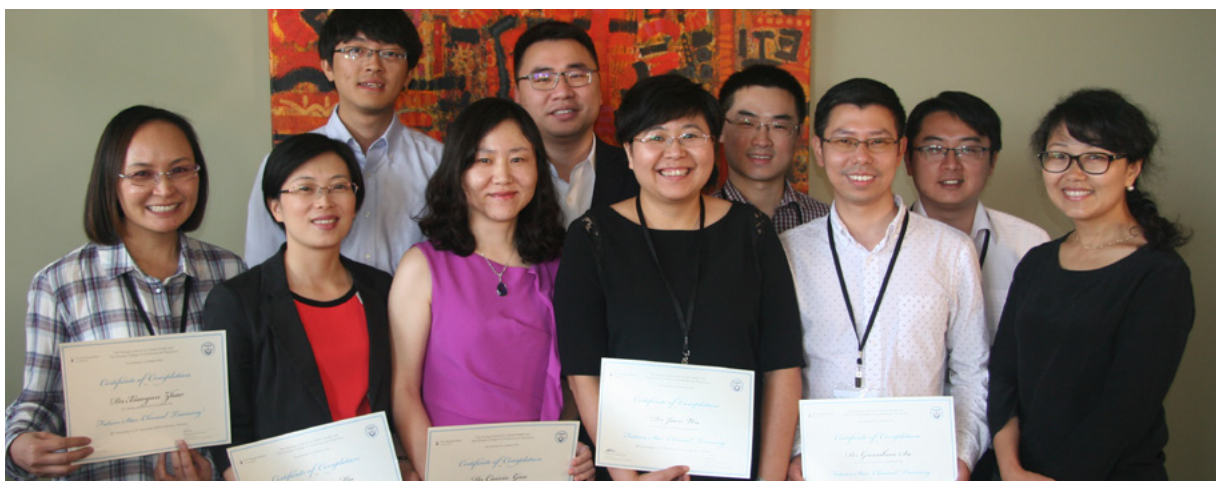
PhD Students from China, in Sydney to complete the Future Stars Clinical Training Program.

"Our research training program is something I am really passionate about," says Peter. "It is based on the belief that, in addition to research we conduct in low- and middle-income countries, we also have a moral obligation to contribute to training the next generation of researchers – to make sure that in 10 or 15 years from now there is sufficient capacity for