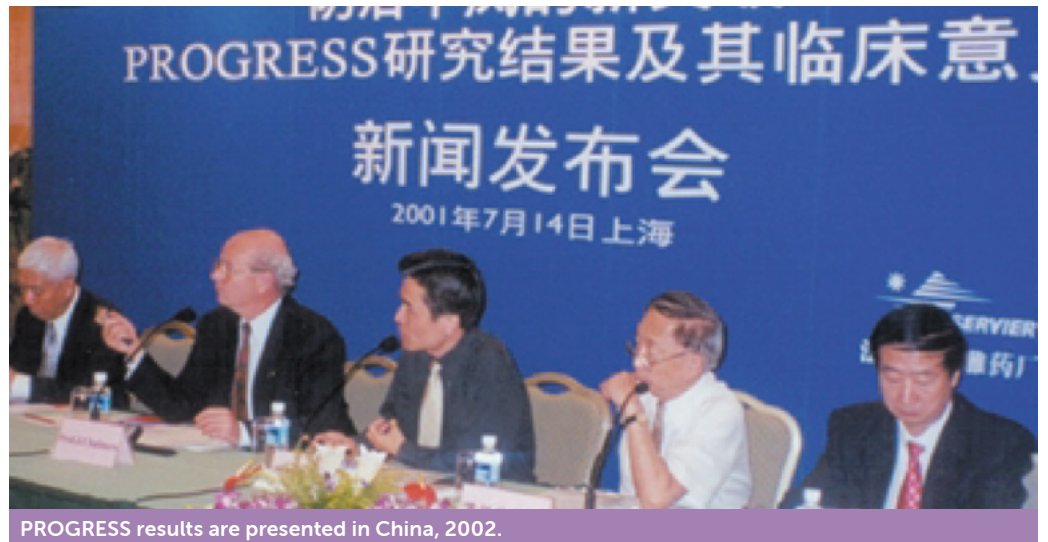
PROGRESS results are presented in China, 2002.

"PROGRESS was a resounding success and helped to launch the Institute with a big bang. Between 35-40% of its patients were in China, Japan, India quite deliberately, so we could demonstrate that they suffered equally and benefited equally from the treatments."