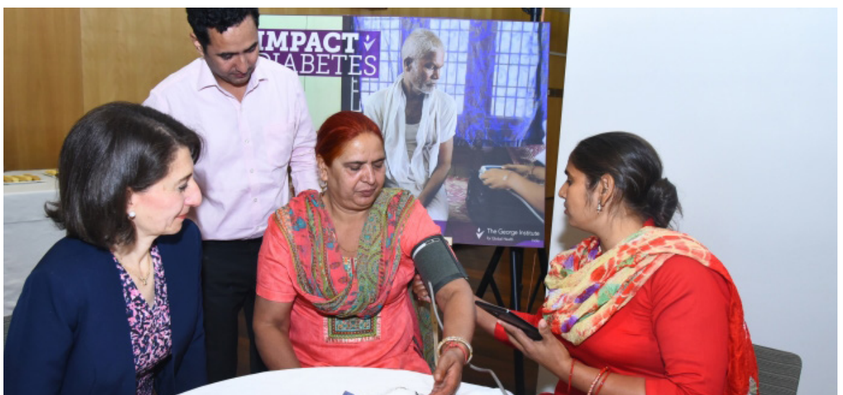
Demonstrating the IMPACT Diabetes app to the Hon. Gladys Berejiklian MP, NSW Premier.

With less than 10% of the population of India covered by health insurance, those suffering