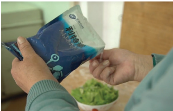
The SSaSS study, examining the impact of a low sodium salt substitute.

"We are trying to determine what's the best way to control blood pressure after an acute stroke for the best patient outcome, as well as manage other variables such as temperature, and glucose and sugar levels," says Craig. "We will expand this project to countries as varied as Chile, Peru, Nigeria, Pakistan and Vietnam."