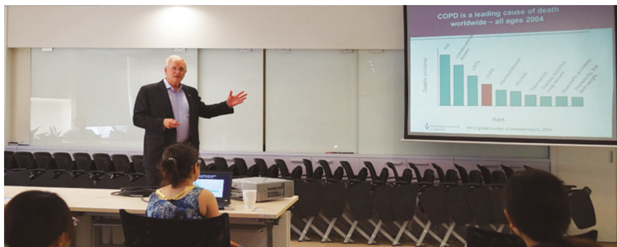
Professor Norbert Berend delivering training in Beijing, China.

"One consequence of COPD is that patients get exacerbations where breathing becomes extremely difficult – often due to respiratory infections," Norbert explains. "These exacerbations have a high mortality rate and reducing them is a major goal of current therapy. There are established successful therapies for reducing exacerbations, but they tend to be very expensive."