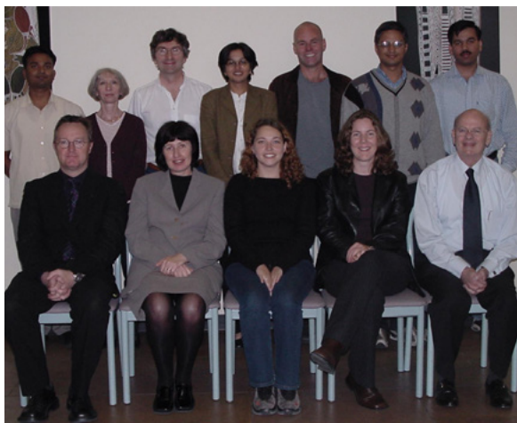
An ADVANCE group meeting in 2002.

Anushka joined the Institute to lead the ADVANCE diabetes clinical trial. This ambitious study included over 11,000 people in 20 countries across Asia, Australia, Europe and North America, and to this day it is still the most comprehensive study of diabetes across the globe.