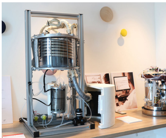
The Affordable Dialysis Machine, developed by Ellen Medical Devices, changing the way dialysis is delivered.

Indeed, from early achievements in slowing the progress of diabetic kidney disease in the CANVAS study, to testing new dialysis protocols in the ACTIVE Dialysis trial, or assessing the safety and efficacy of 40-year-old treatments in the TESTING study, researchers at the